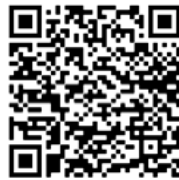
Ducted Systems Solutions Mobile App (Android)

After downloading the app, log in using your Solution Navigator credentials.