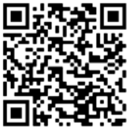
Ducted Systems Solutions Mobile App (Apple)